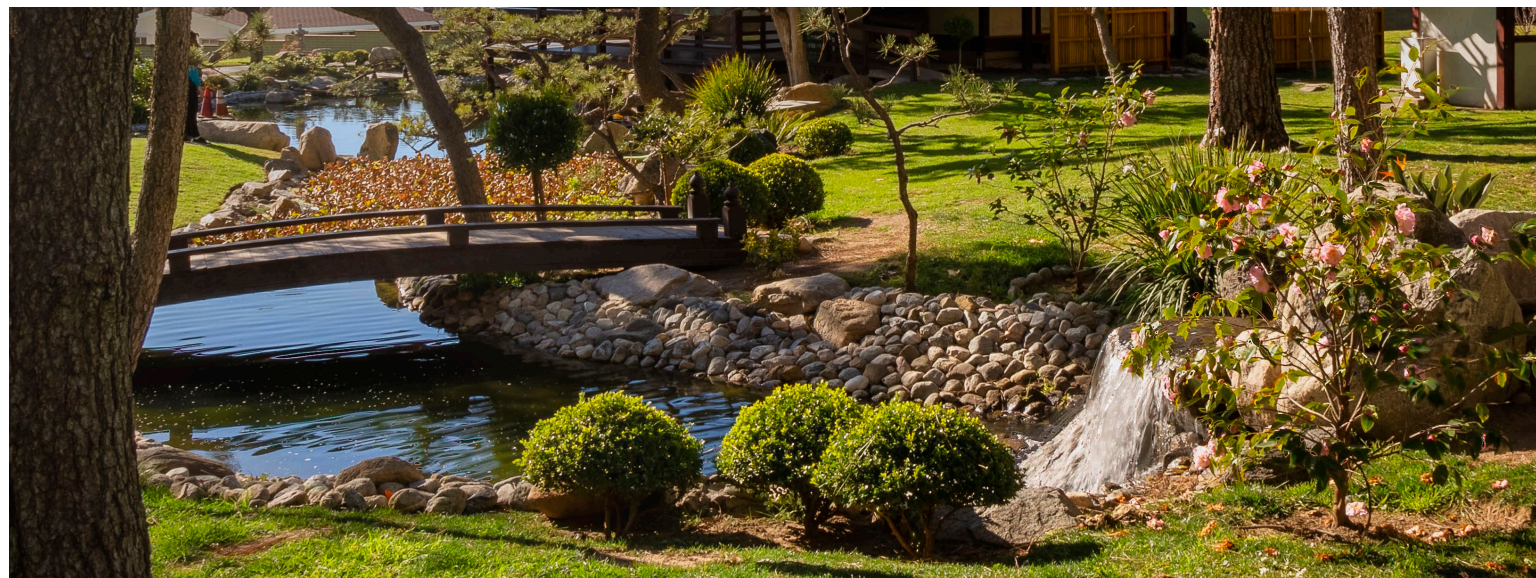
Koi pond, at Brand Park, nestled at the foot of the Verdugo Mountains in Glendale .