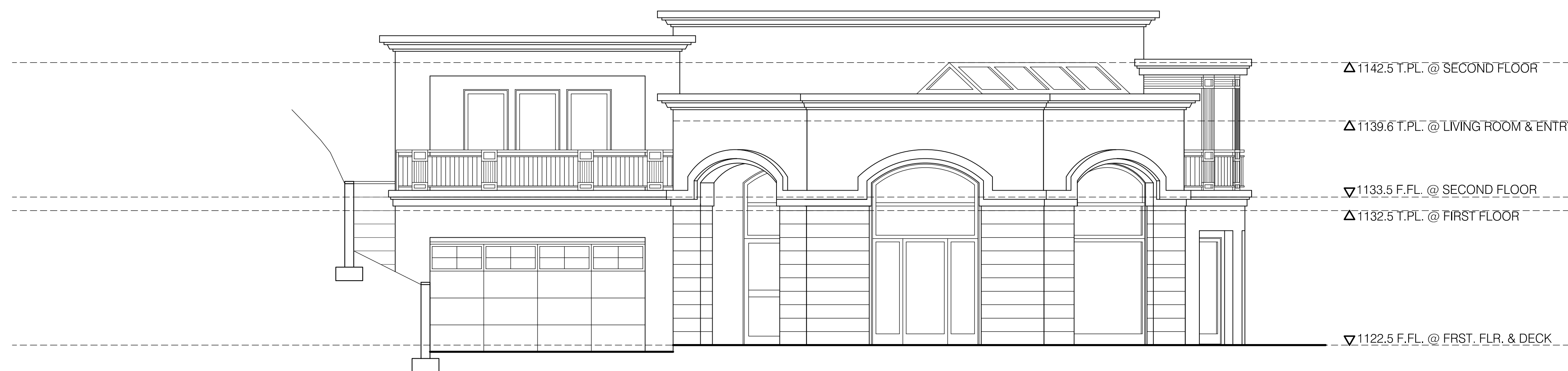
1 WEST ELEVATION 3/16" = 1'-0"