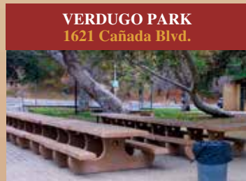
VERDUGO PARK 1621 Cañada Blvd.