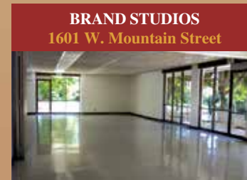
BRAND STUDIOS 1601 W. Mountain Street

Fees: $50/hour (4 hour minimum) plus a $200 conditionally refundable deposit