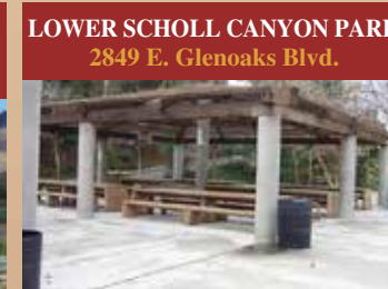
LOWER SCHOLL CANYON PARK 2849 E. Glenoaks Blvd.

Fees: $40/hour (5 hour minimum) plus a $200 conditionally refundable deposit