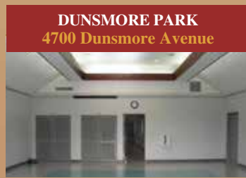
DUNSMORE PARK 4700 Dunsmore Avenue

Fees: $52/hour plus a $200 conditionally refundable deposit