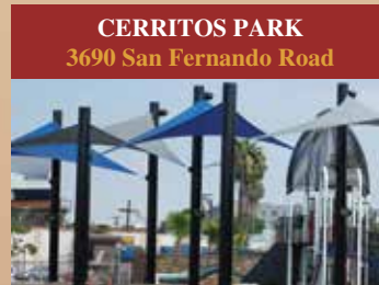
CERRITOS PARK 3690 San Fernando Road