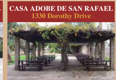
CASA ADOBE DE SAN RAFAEL 1330 Dorothy Drive

Fees: $40/hour per pavilion (5 hour minimum)