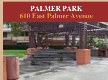
PALMER PARK 610 East Palmer Avenue

Fees: $40/hour (5 hour minimum) plus a $100 conditionally refundable deposit