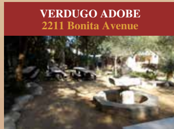
VERDUGO ADOBE 2211 Bonita Avenue