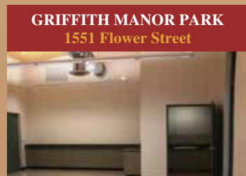
GRIFFITH MANOR PARK 1551 Flower Street